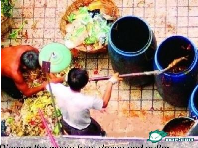
Digging the waste from drains and gutter