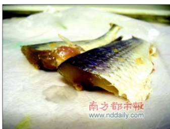
这块会发光的鱼肉乍看上去和平常的鱼肉没什么区别。